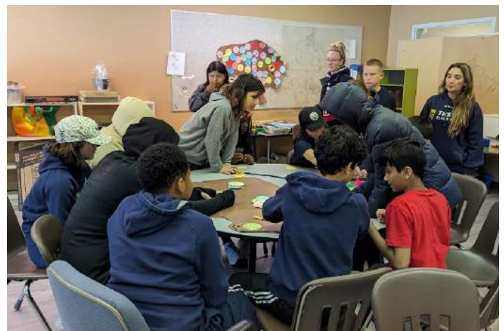
Another partnership in action, this time with visiting students and staff from Thrive Charter School. Clockwise from above: