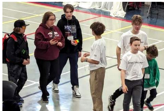
Clockwise from immediate left: