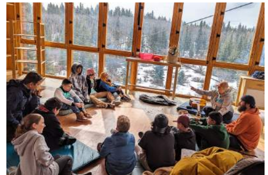
Right, top: Connect students explore the model village in our museum classroom.