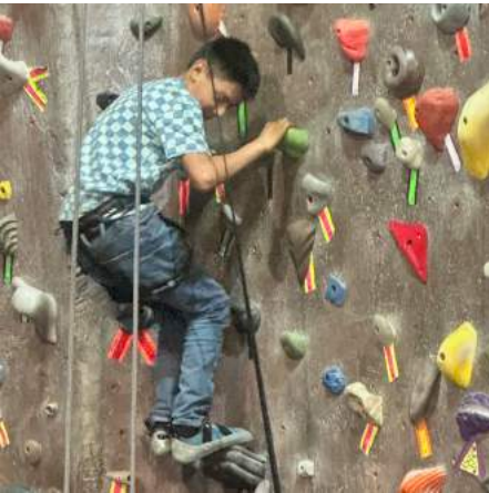
Celebrating our partnership with Spirit North with a day of rock climbing adventures at Vertically Inclined.

Spirit North also purchased all of our archery equipment and treated our students to a day of rock climbing at Vertically Inclined.