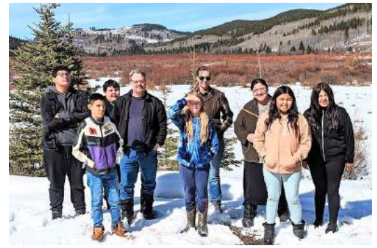
Above: Enjoying the view at Camp Connect.