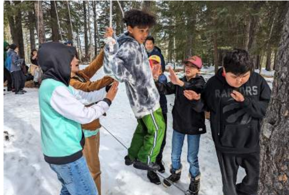
Left (top, middle, bottom): Students exploring the rope course at Camp Connect.