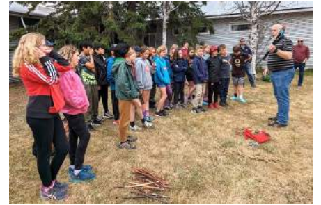
Above: Playing Indigenous games.